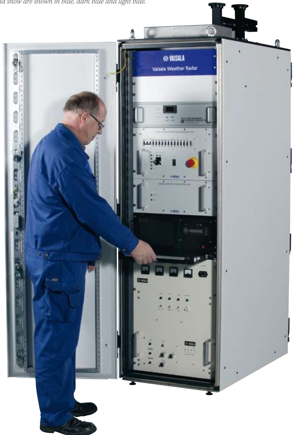
Vaisala Weather Radar cabinet