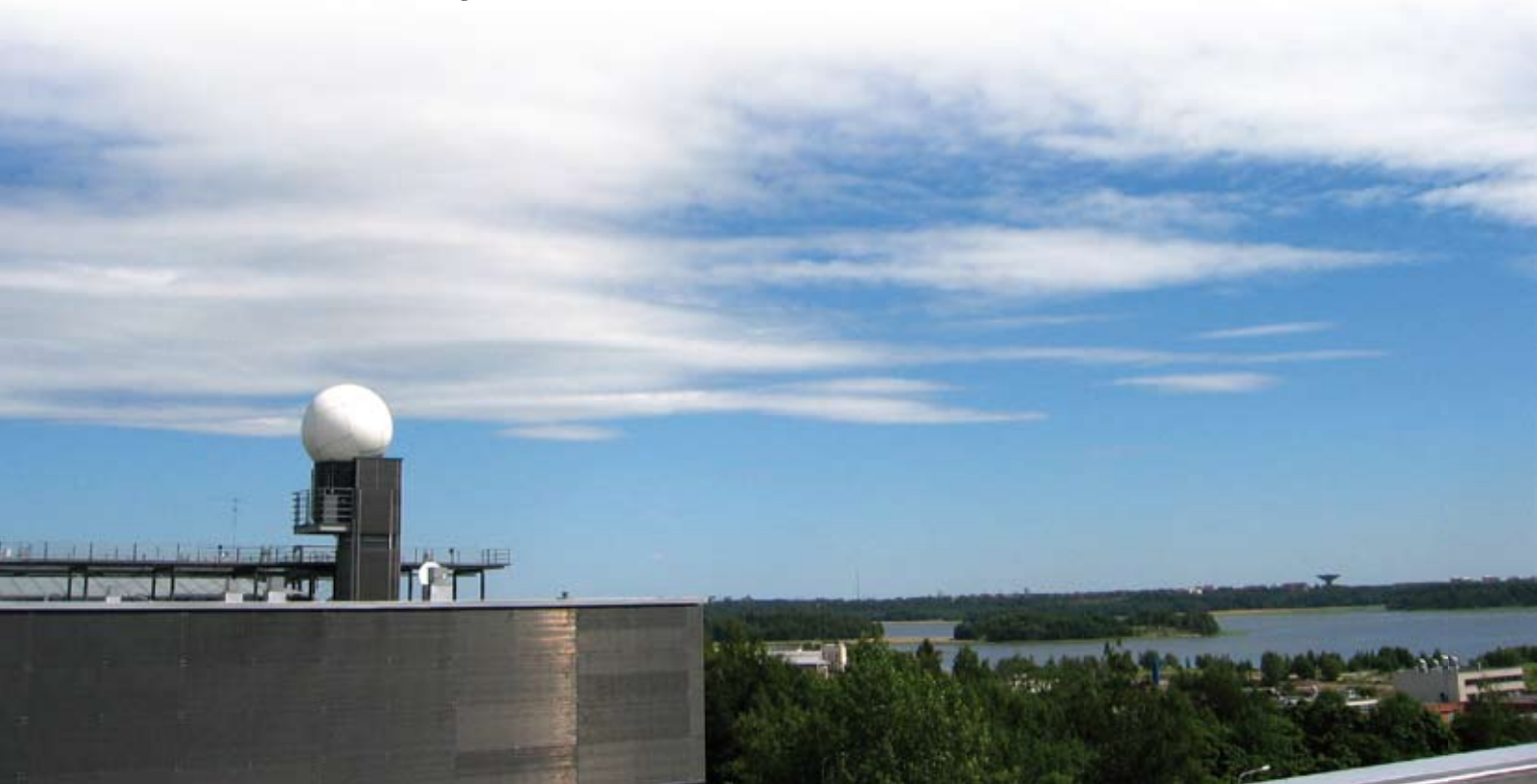
Vaisala Weather Radar at Kumpula, Helsinki 16-Jun-06. Alto cumulus clouds at 2700m in the background.

www.vaisala.com/weather/products/weatherradar