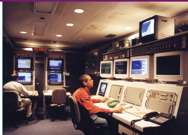
Command & Control Shelter